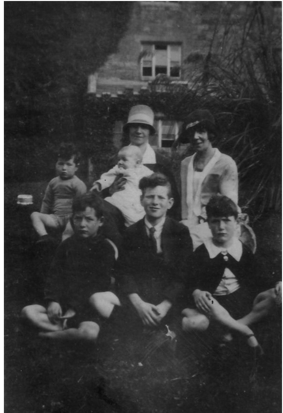
1927 St. John's Hospital Limerick