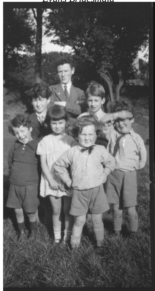
Cousins in the park 1931